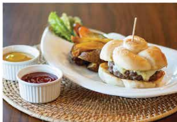
Steakhouse Burger All-beef patty with caramelized onions, roasted garlic aioli. Served with mozzarella, emmental, and brie cheese on a kaiser bun. 780