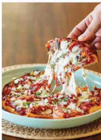
Pizza Junior Ham and Cheese pizza. 280