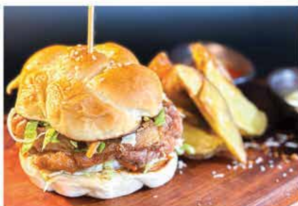
Fried Chicken Sandwich Boneless Cajun-spiced chicken, cabbage slaw and pickled chili on a house-baked kaiser bun. 600