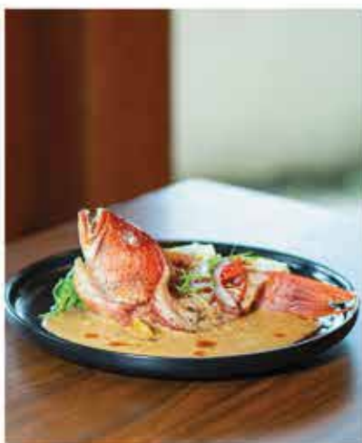
Garoupa in Coconut Ginger Sauce Baked garoupa, braised bokchoy, curry coconut ginger sauce. 900