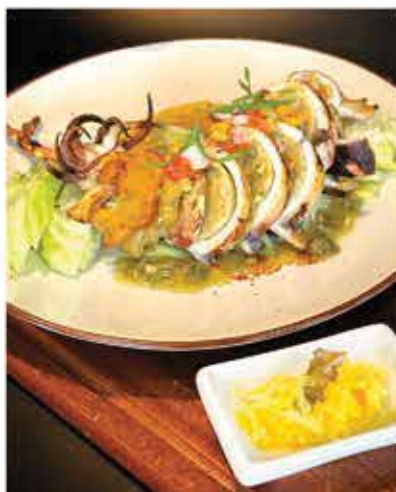
Stuffed Squid Grilled stuffed squid with lemon caper butter. 690