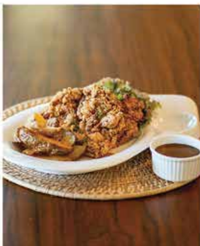
Country Fried Chicken Boneless Cajun chicken with house gravy and potato wedges. 600