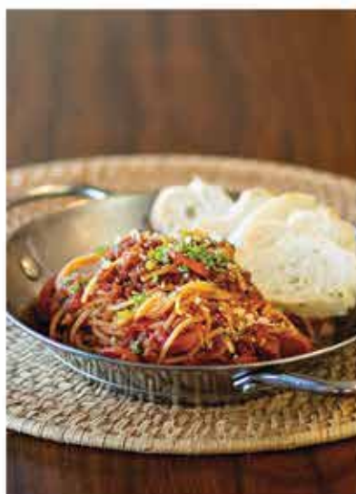
Sweet Spaghetti Sweet style sauce, meat and hotdog topped with cheddar cheese. 300