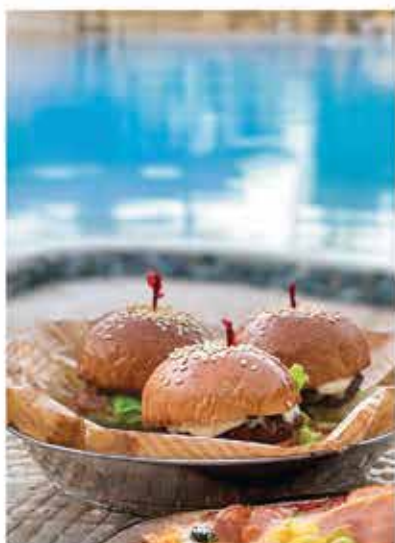
Baby Burgers All beef patty, cheese and burger dressing sided with potato wedges for the young ones. 280