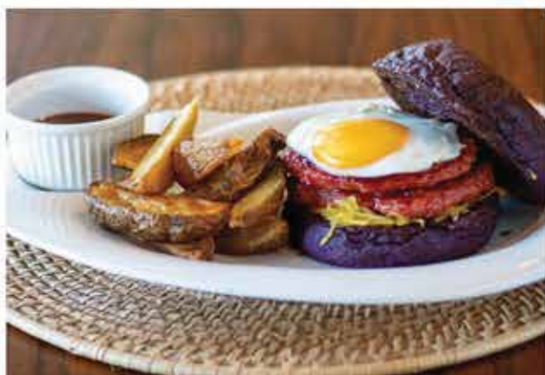
Chori Burger Homemade Bohol-style sweet chorizo, white cheese, and fried egg with local barbecue sauce. 560