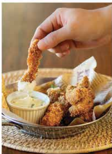
Chicken Fingers and Ranch Battered chicken fingers with ranch dip. 320