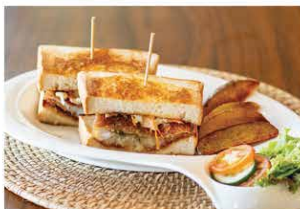
Fish Katsu Sandwich Herb-parmesan crusted fish fillet sandwich with cabbage slaw. 580