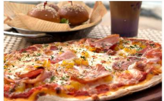
Pineapple and Ham Pizza