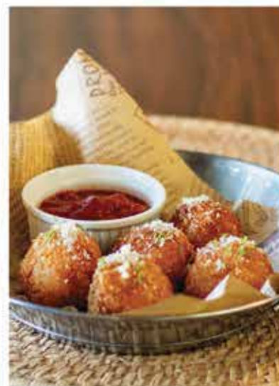
Mac and Cheese Balls Deep fried macaroni and cheese balls with marinara. 300