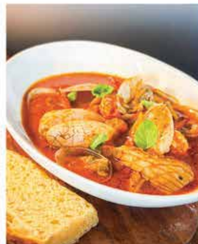
Seafood Cioppino Mixed seafood stew in light tomato broth. Served with toasted garlic focaccia. 690