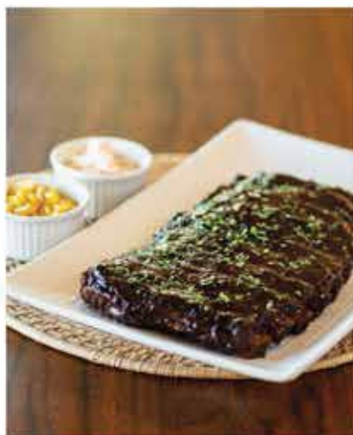
Smoked Pork Ribs Cajun-rubbed ribs in house barbecue sauce with buttered corn and cabbage slaw. 1200